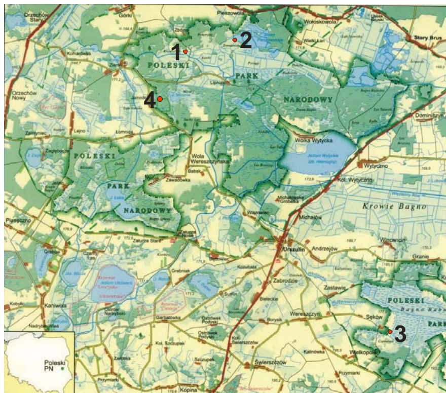
Fig. 1. Distribution of measurement points within Polesie National Park [Kałmucki et al. 2001, modified]

Four selected drainage ditches located in the Polesie National Park (Fig. 1), different relating to their habitats and morphology, were the study objects.