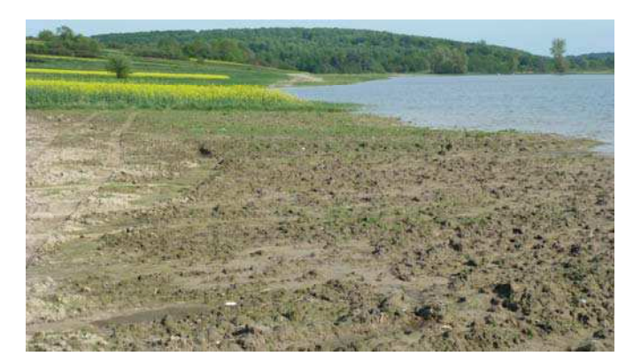
Photo 2. Lack of buffer zone between the shore of the reservoir and arable fields (2013)