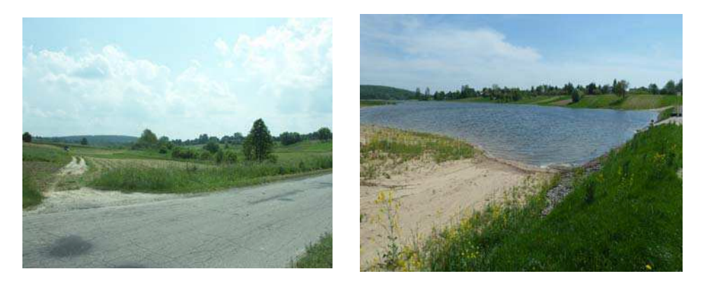
Photo 1. View of the valley of the Milutka stream before construction of the reservoir and after its completed (2009, 2013)

its whole surroundings are arable fields or pastures (directly bordering with its shore), and only on the east there are grasslands. Ploughing fields to the very shore of the reservoir took place in a few cases (Photo 2). Such a method of cultivation and location of the arable fields on slopes favours rapid runoff of contaminated rain and snowmelt waters into the reservoir.