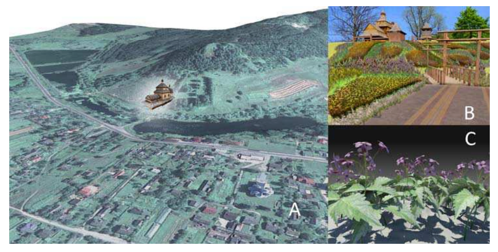
Fig. 3. Extract of landscape of Potelycz village: A – general view (3D visualization of the church was inserted in the middle); B – concepts of planting out, view on the church, C – example of plants in 3D

The renewal of landscape that surrounds such an unique relic of national significance has gradually become even more apparent. However, in reconstruction it is possible not only to show how to improve the esthetic appearance but also how to preserve the soil stability of a hilly terrain. In the 3D model there are proposed some particular plant species, represents for unique beech and pine forests in Roztocze ( Aconitum firmum Rchb.; Cerastium pumilum Curt.; Symphytum cordatum Waldst. et Kit; Dentaria glandulosa Waldst.et Kit; Senecio nemorensis L.), around the church which will firstly comply with the requirements of the hilly and unstable terrain that surrounds that church, and secondly will provide greater protection from possible soil erosion by hardening it.