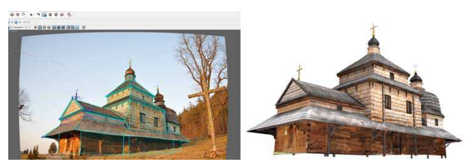
Fig. 2. Photography (left) and 3D geometry (right) of the church

2D photography should met the following conditions: fixed focus for photography is 28 mm; 8 photos were located around the church every 45° (Fig. 1B); length, width and high of the church was determined according to field measurements; on the basis of measurements virtual apparatuses were situated in the field with the use of CameraMatch; the Standard Primitives geometry was fitted into the church's structure.