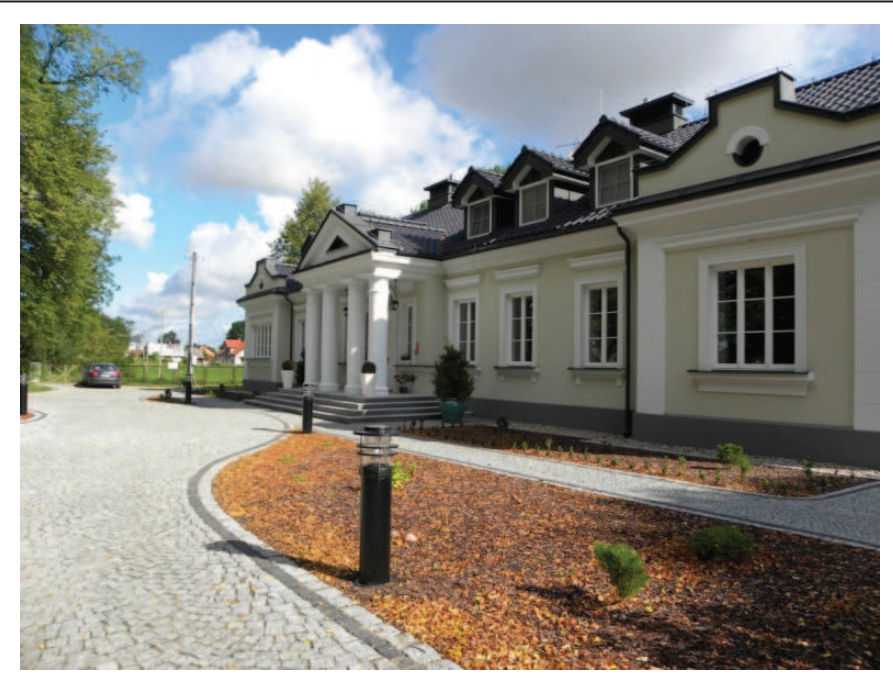
Fig. 1. View of the front facade of the manor in Droblin in 2012 (by M. Dudkiewicz)