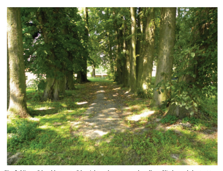
Fig.\ 2.\ View\ of\ the\ oldest\ part\ of\ the\ eighteenth-century\ park\ -\ alley\ of\ linden\ and\ chestnut\ trees\\ (by\ M.\ Dudkiewicz)