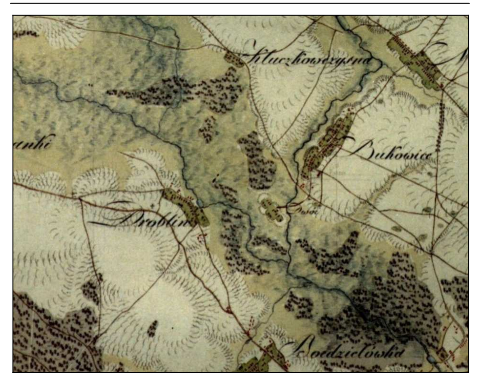
Fig. 2. Military map by Anthony Mayer von Heldensfeld [copy in possession of the authors]