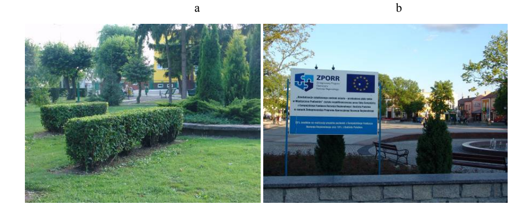
Fig. 3. Preserved market square of small town: a – Grabowiec, b – Międzyrzec, (E. Przesmycka, 2008) Ryc. 3. Odnowione rynki miasteczek: a – Grabowiec, b – Międzyrzec, (E. Przesmycka, 2008)

The precised documents concerning the method of planning the cities indicate how it should shape the future of the city's image. Second Athens Charter approved in 2003 presupposes the consistency of the modern city and its historical continuity while improving the quality of life. The processes taking place in the cities should retain the so-called "genius loci" of the city, which creates a unique cultural landscape (fig. 3). This card also draws attention to the durability and aesthetic quality of the area. Unfortunately, in Polish conditions this is only a theory.