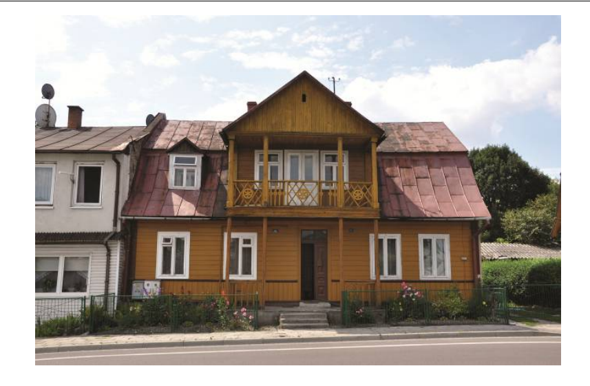
Fig. 2. Two-storey wooden house in Hrubieszów Zamojska Street 32 Ryc. 2. Dwukondygacyjny dom drewniany w Hrubieszowie przy ulicy Zamojskiej 32

At the end of the twentieth century the attention began to be paid to the poor state of Polish towns that had been neglected over the years. This behaviour was due to, inter alia, Polish accession in 2004 to the European Union. Thanks to the various EU programs, Poland was receiving financial support for the improvement of social life and the revitalization of urban space.