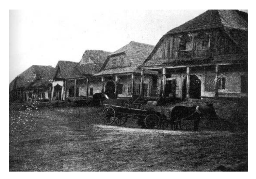
Fig. 1. Historical wooden buildings in Goraj in the 1930s. (Archive Teatr NN, Lublin) Ryc. 1. Historyczna zabudowa drewniana w Goraju w latach 30. XX w. (Zbiory Teatru NN, Lublin)

In the Lublin region there was predominantly rectangular shape of the market (e.g. Szczebrzeszyn, Bychawa, Józefów), square (e.g. Izbica) and trapeze (e.g. Frampol, Chelm). Markets of small towns have a compact single-storey building, while on the markets of major cities this building reached the size of two or three storeys. Frontage of outer block of market place length ranges from 50 to over 200 m. [Przesmycka 2008]. Most of the buildings were the mid-nineteenth century wooden buildings, in later times they were replaced by brick buildings. Houses located in frontages of inner block of market place were for the most part of the arcade construction (the example can be the market in Goraj, Wojsławice) set facing the frontage.